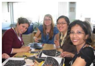
2008/2009 Elementary I & II students material making